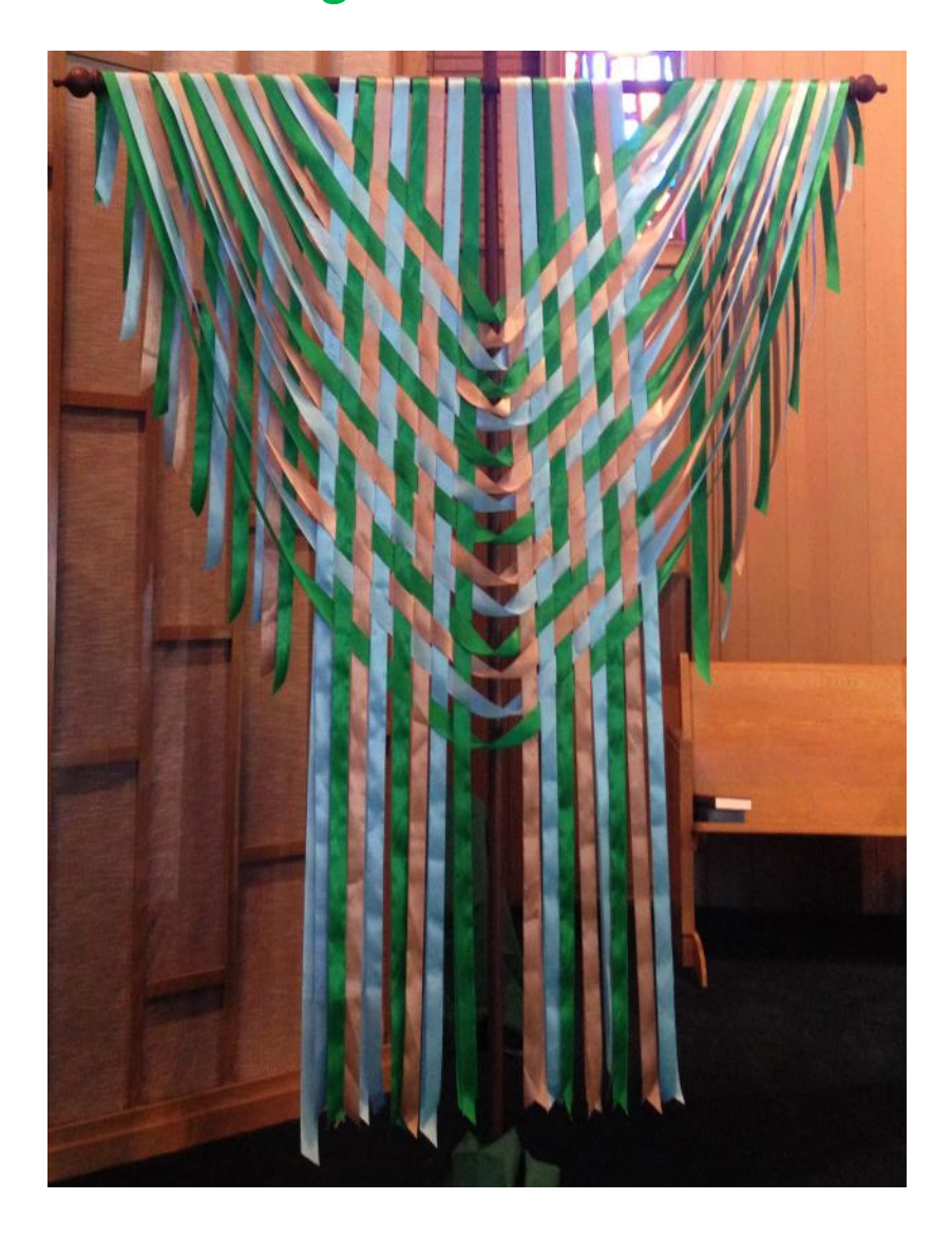
2018 Lenten Devotions Written by BLC Parishioners and Friends